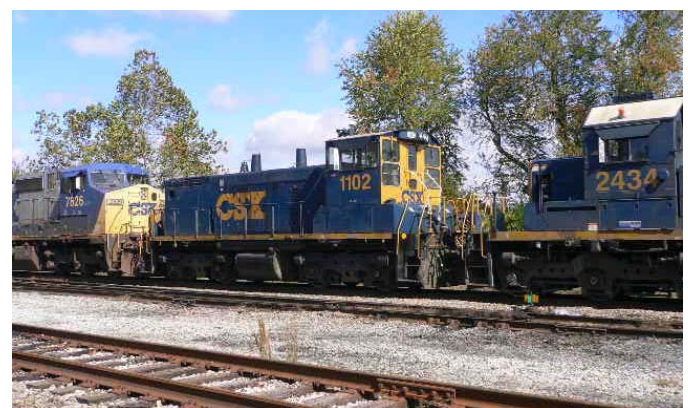
SW 1001 switcher makes a brief appearance at Atkinson Yard, Madisonville!